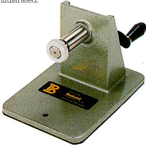
Laboratory stand for coating the Recording Drum.

The Spore Trap is supplied with one roll of 'Melinex' tape and one roll of double-sided tape, together with the laboratory stand and perspex cutting block as illustrated.