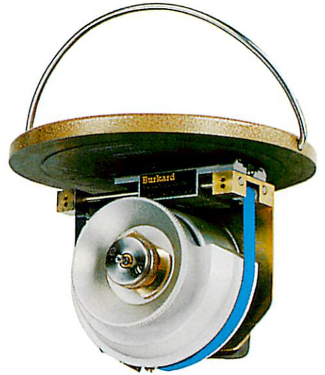
Alternative lid assembly for 24 hours sampling directly onto glass slide.

40/20 'Gelvatol' available in 1/2 kilo packs. Additional drums.