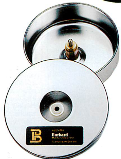
Anodised aluminium carrying case with lid.