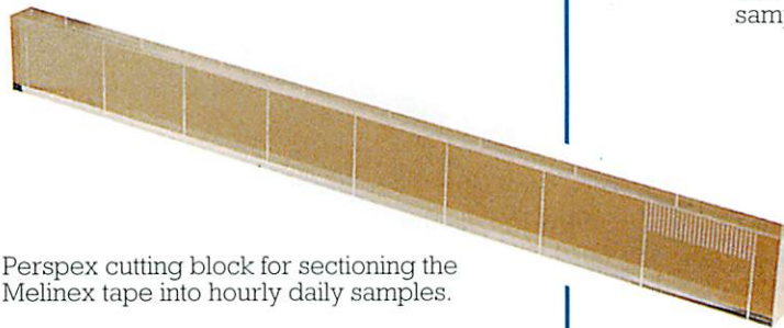
Perspex cutting block for sectioning the Melinex tape into hourly daily samples.